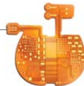
High density interconnect Rigid-Flex allows designers to fold circuits in a 3-dimensional configuration to take advantage of the vertical space within a device.